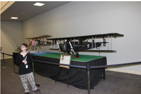
One of the club members looking around the static display during the 2011 AMA Show.

Active military with ID, Boy Scouts, Girl Scouts, Sea Cadets etc...enter for free