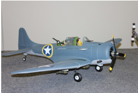
Another one of the static models on display.